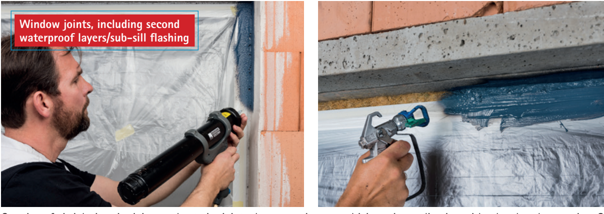
Creation of airtight interior joints and exterior joints that are resistant to driving rain, application with a brush or by spraying. Can be used flexibly on fibrous insulation materials (e.g. hemp wool or sheep wool) and on spray foam. Interior and exterior joints tested and confirmed in accordance with the IFT Guideline MO-01/1:2007-01, Section 5.