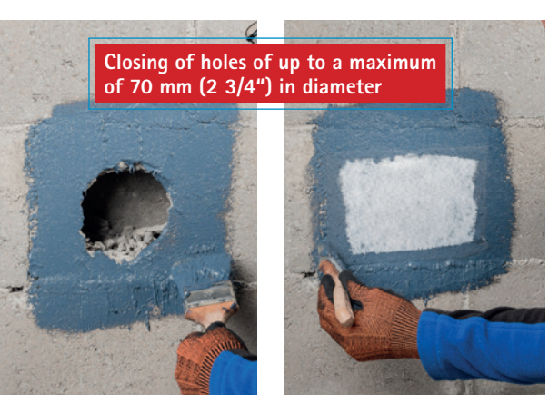
If there are large gaps in the subsurface, simply combine AEROSANA VISCONN with AEROSANA FLEECE.

Wide cracks can be sealed and made airtight in an easy, time-saving manner using the fibre-reinforced AEROSANA VISCONN FIBRE sealant, which can be applied with a brush or by spraying (AEROFIXX).