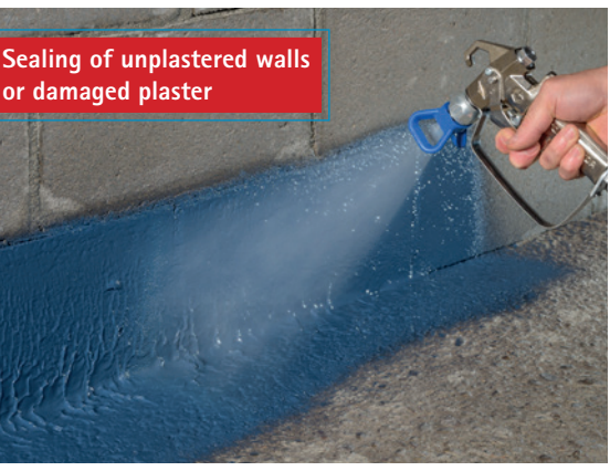
Creation of airtightness on unplastered masonry.

proclima.info/en/aerosana-visconn-products