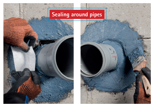
Seal joints with round penetrations – e.g. pipes – using AEROSANA VISCONN and AEROSANA FLEECE.