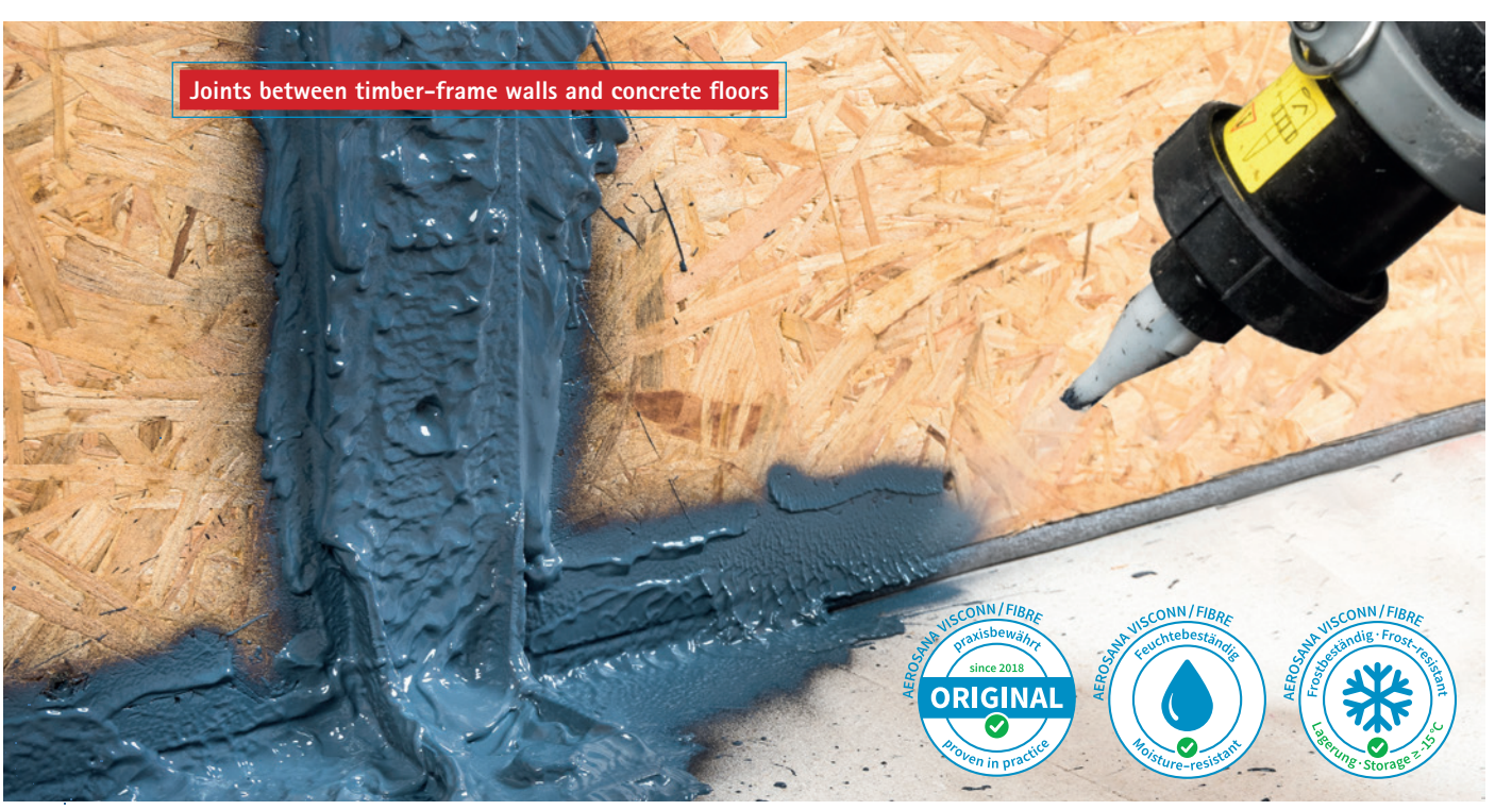
Airtight transitions between wood-based panels (e.g. OSB) and concrete slabs, for example. Swelling mortar can easily be covered over. It is easy to spray over difficult, uneven geometries (e.g. fastening fittings such as brackets). Durability has been tested and confirmed as per EN 13984.

Watch the video – AEROSANA VISCONN is extremely versatile!