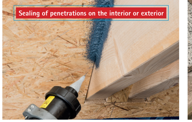
Simple airtight sealing of penetrations (e.g. collar ties or rafters when carrying out roof refurbishment from the outside.)

For more information on the AEROSANA VISCONN system: