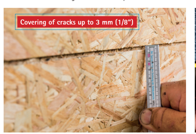
Easy sealing of cracks or joints by spraying or applying with a brush. The gaps are filled in using AEROSANA VISCONN and sprayed over.

Airtight transitions between CLT elements and concrete slabs, for example, including difficult, uneven geometries (e.g. brackets). The surface layers of the components must be airtight for this to work. Swelling mortar can easily be covered over.