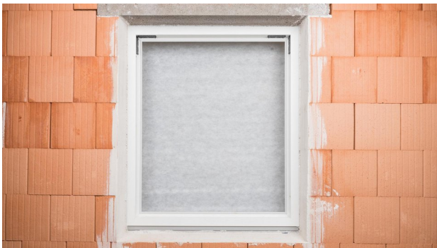
1. Initial situation Window is installed, window joint has been filled with insulation material.