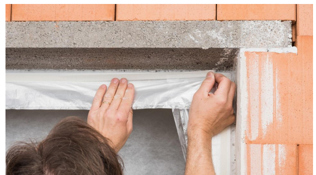
4. Apply masking tape to the window frame When doing this, leave a strip with a width of at least 6 mm free on the frame for subsequent sealing using AEROSANA VISCONN / FIBRE. Alternatively, remove the joint insulation to a sufficient extent to create a clean surface for a lateral bond to the side of the window frame.