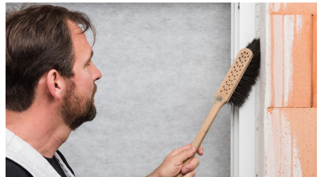
2. Preparation Brush off subsurfaces; if necessary, clean with a vacuum cleaner and wipe down.