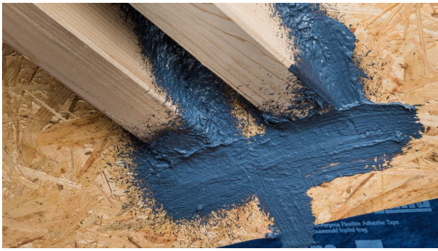
9. The finished joint at a double collar tie penetration Window joint with AEROFIXX